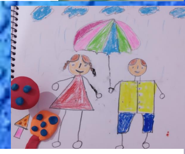
Children drew with the help of different lines and already learnt shapes