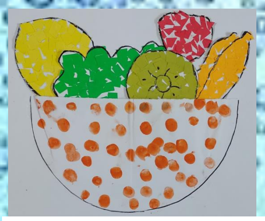
Children did tearing and pasting in cut out of fruits