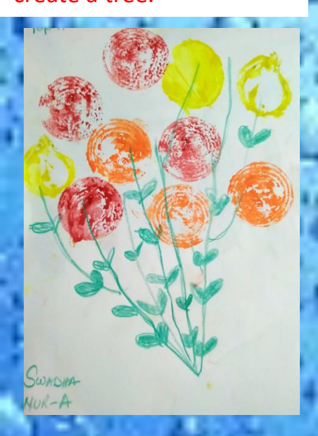
Children made flowers with the help of onion printing