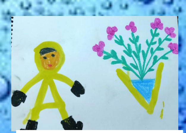
Children drew alphabets using slanting lines and also made objects related to that alphabets