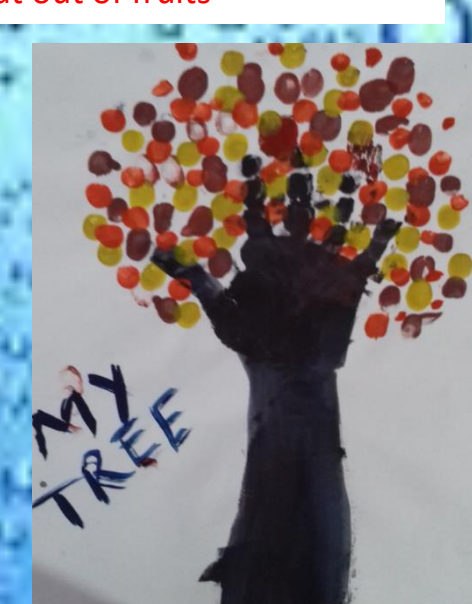
Children did printing using their hand and finger to create a tree