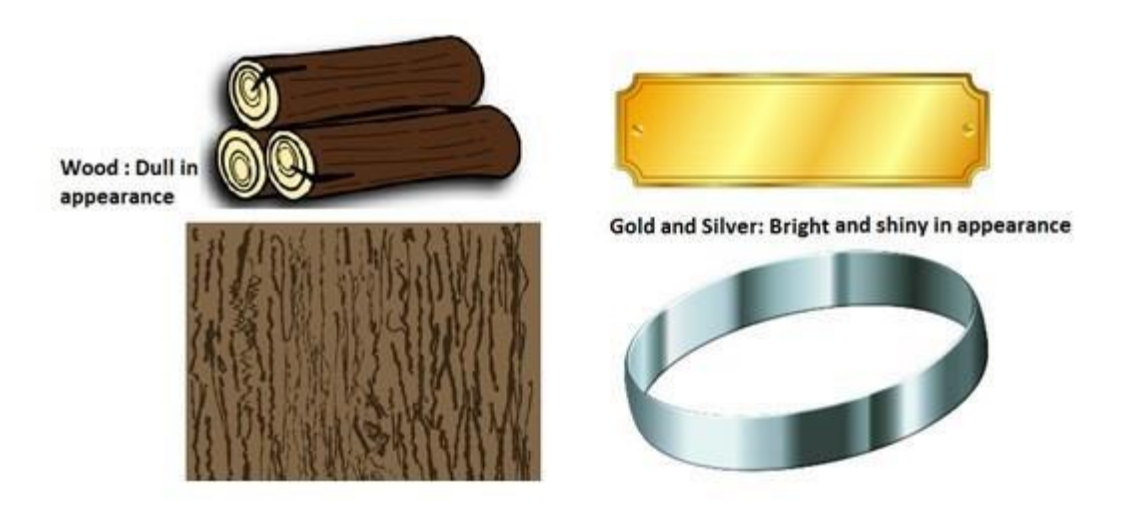
Figure 1: Lustrous vs Non-lustrous materials