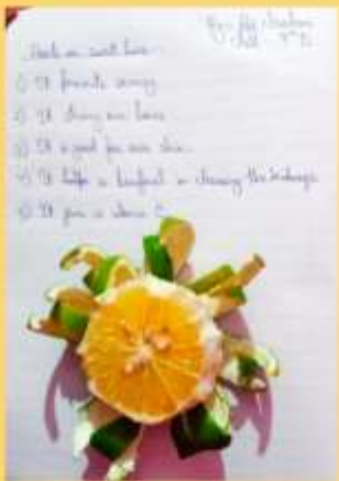
'Fantastic Friday' Sweet Lime

Students were asked to use Sweet lime or mosambi in any form for their daily needs. As it is a popular tropical fruit, available in all seasons. This sweet and sour tasting fruit looks more like a lime for appearance and is mostly consumed in the form of juice than as a whole fruit.