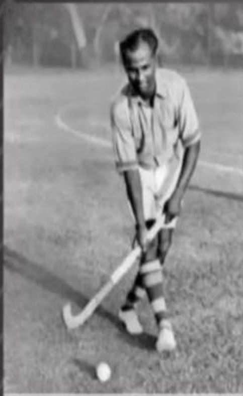
Major Dhyan Chand

Vivekananda House special assembly video was shown to the students. The students got to know about the national sport of India and Major Dhyan Chand's contribution to it. They also got to know the details of all the seven medals won by India in Tokyo Olympics